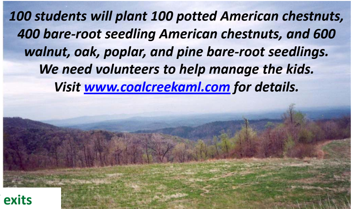
Coal Creek Arbor Day planting site after ripping by the Forestry Reclamation Approach

100 students will plant 100 potted American chestnuts, 400 bare-root seedling American chestnuts, and 600 walnut, oak, poplar, and pine bare-root seedlings. We need volunteers to help manage the kids. Visit www.coalcreekaml.com for details.