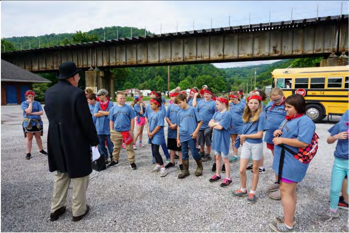
Coal Creek Train Depot