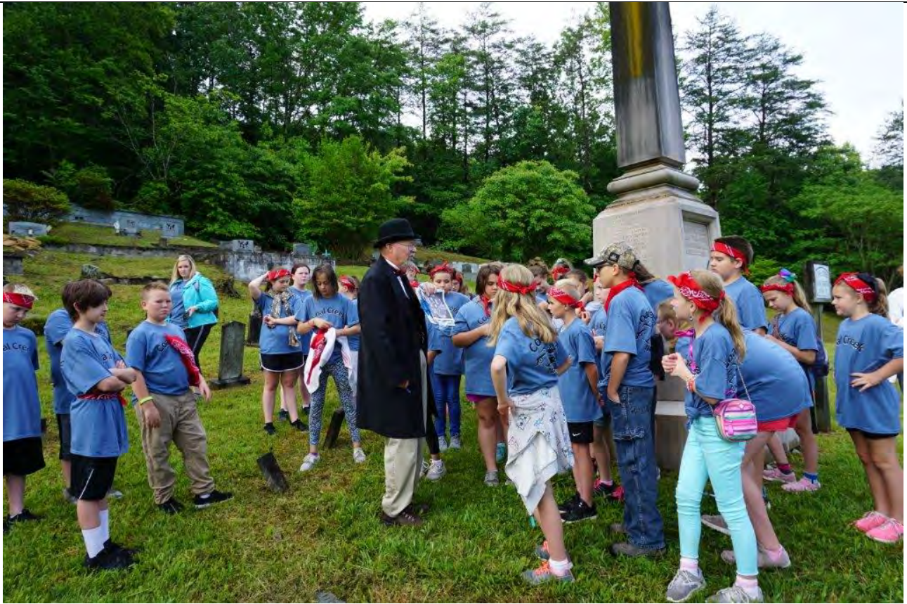
Cross Mountain Miners Circle