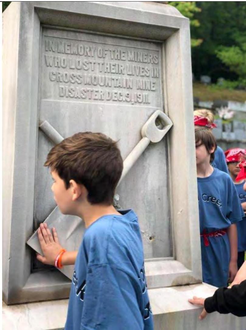
Cross Mountain Miners Circle memorial