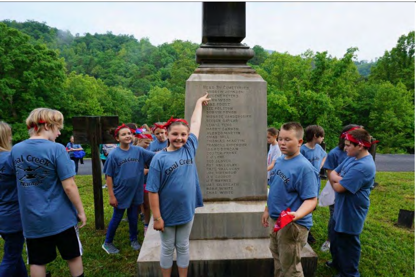
Cross Mountain Miners Circle