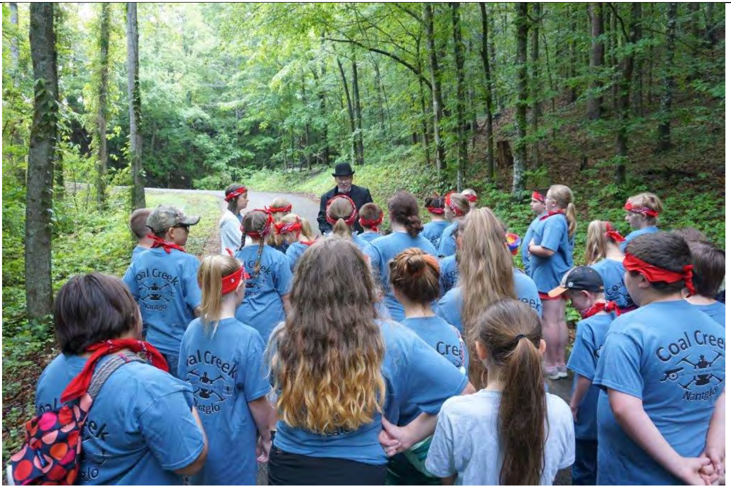
Circle Cemetery at Briceville