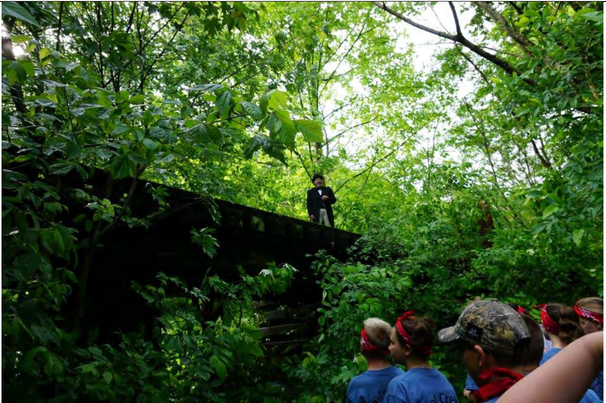
Drummond Bridge where Dick Drummond was hung during the Coal Creek War