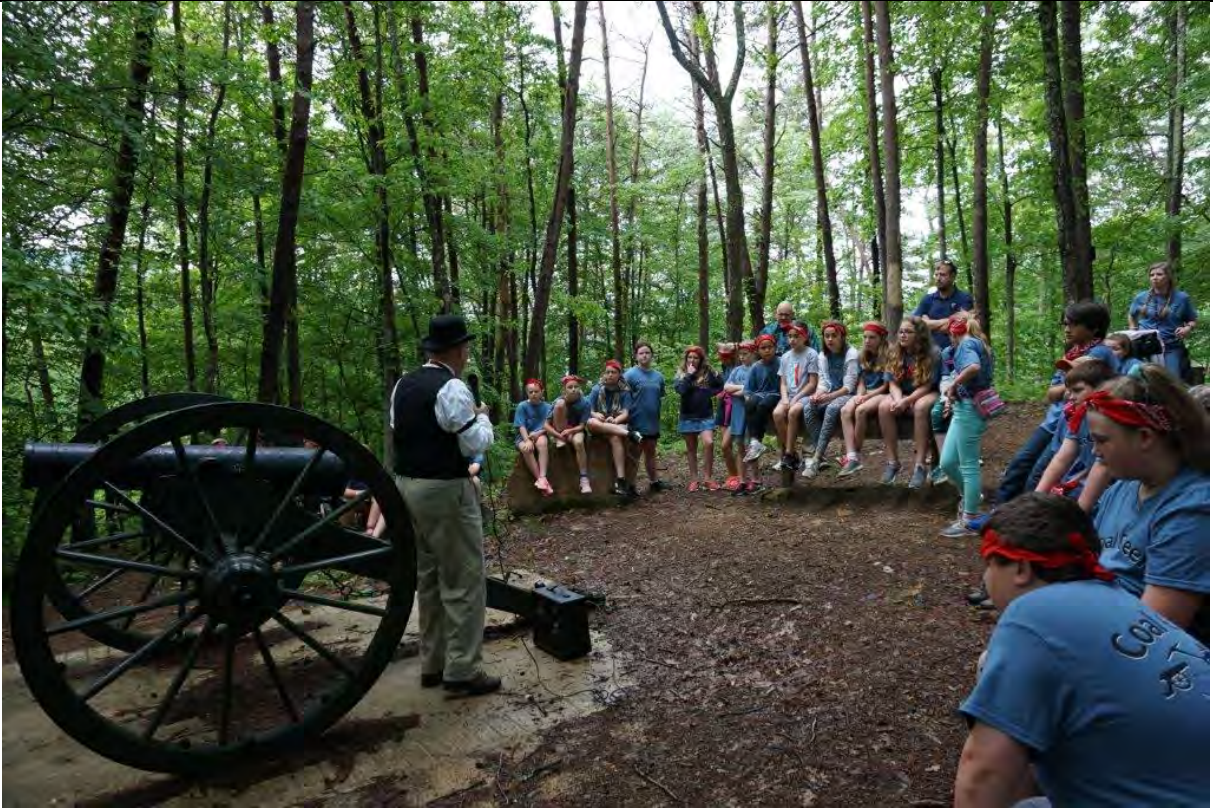
Fort Anderson on Militia Hill