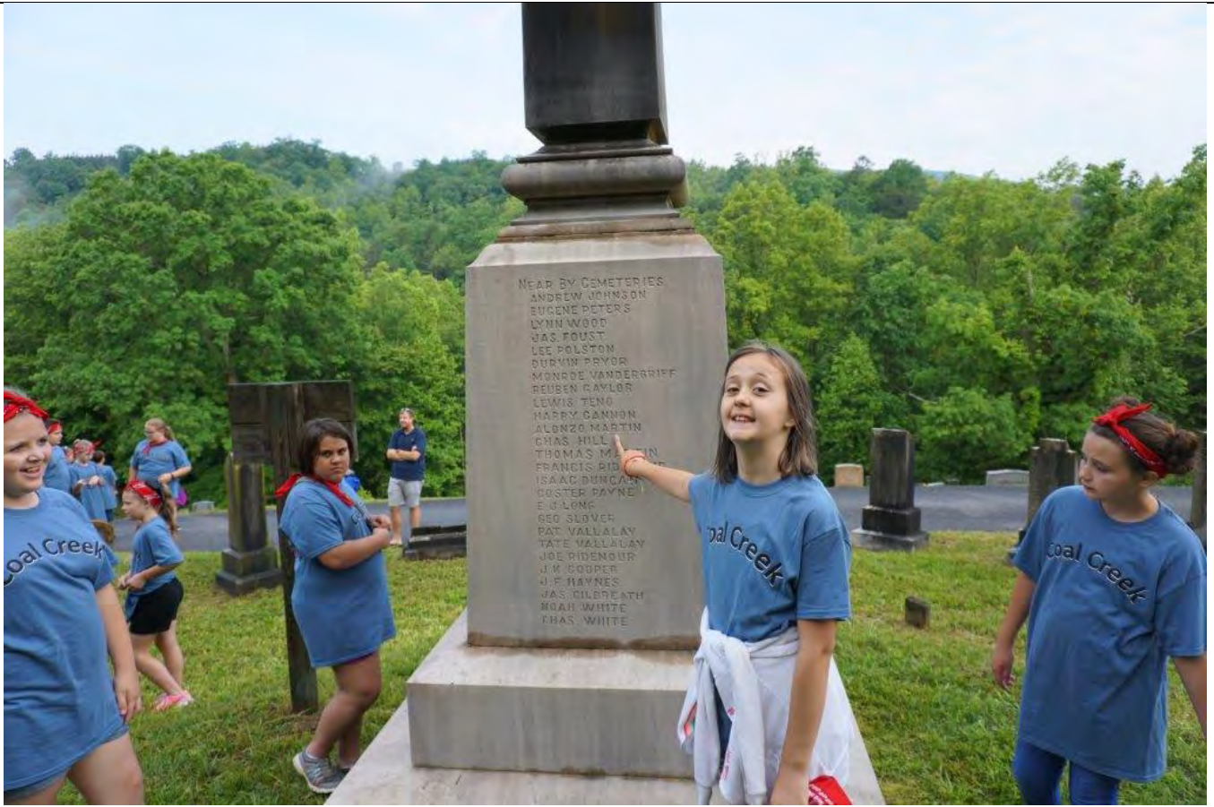
Cross Mountain Miners Circle