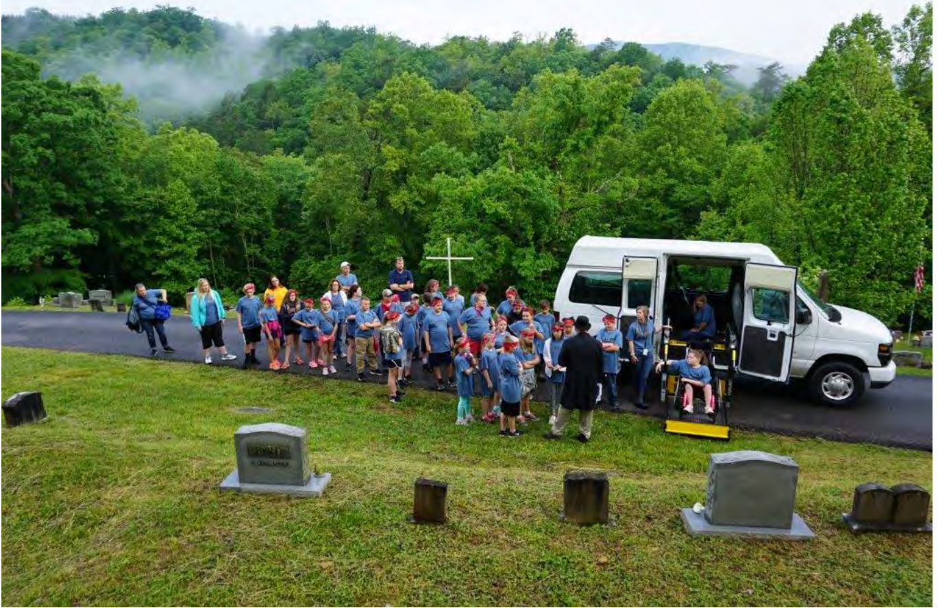
Cross Mountain Miners Circle