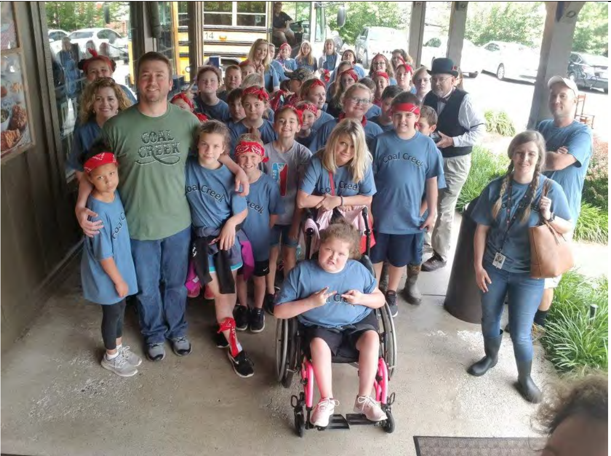
Cracker Barrel for lunch!