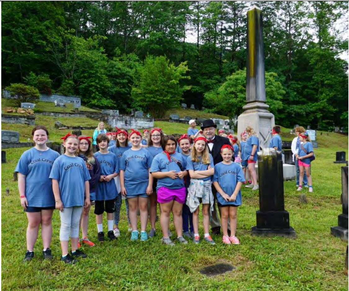
Cross Mountain Miners Circle